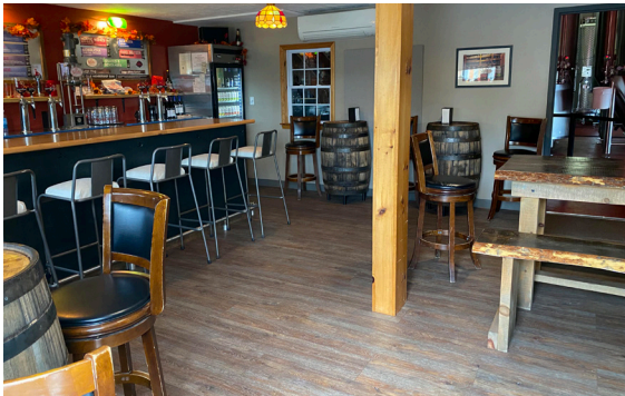
Bar in Taproom