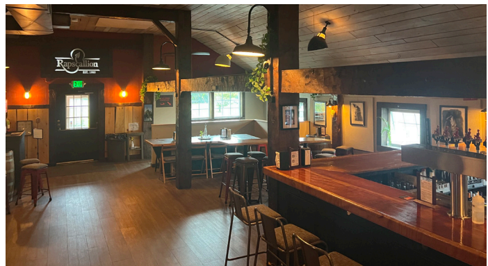
Upstairs Main Room