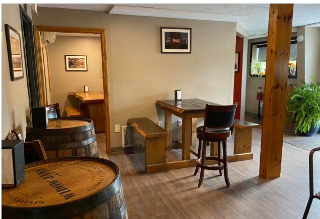
SPENCER | BREWERY & TAPROOM