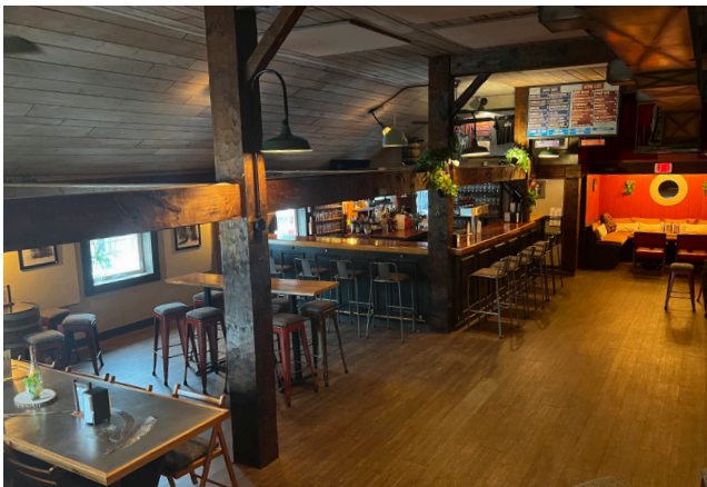
STURBRIDGE | PUB