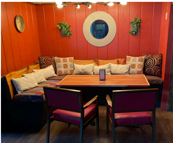
Nook (part of main dining area)