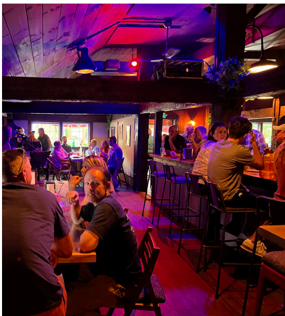
Upstairs Side Room